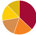
Allocation of underlying funds†